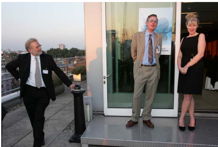
"Addressing the Audience"

We also had a visit from an international panel of experts deliberating on the future organisational form of our School, and after deliberation they agreed that the current form of an independent School was best for all activities carried out.